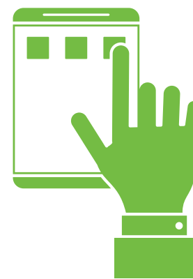
App Group Code